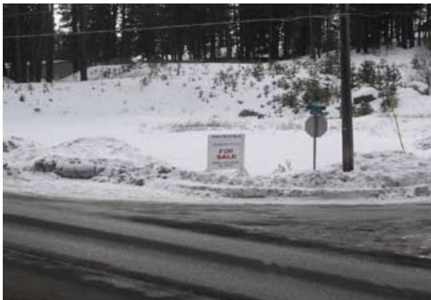
CORNER OF 3RD (HWY 55) AND SUNSET

CORNER OF 3RD (HWY 55) & SUNSET LOOKING SOUTH